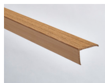
Cinnamon - 163