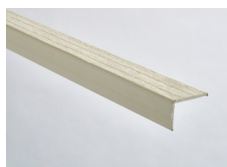
Cement - 164