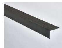
Black - 165